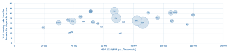
Fig.3» Share of housing costs in a households' disposable income