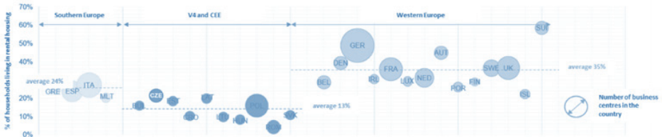
Fig.2» Share of total number of households living in rental housing

Source: own analysis based on data from Eurostat and Deloitte